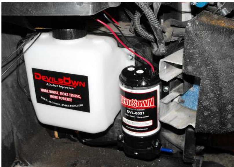
Figure 2: Pump placement

The DevilsOwn pump should be mounted below and as close to the reservoir (tank) as possible using four of the #10 x 1½" screws. Make sure to mount the pump away from heat, moisture and road debris. Because the pump will work at any angle, installation angle does not matter. Notice on top of the black pump housing, there are two arrows indicating the direction of fluid flow to and from the pump. The port with an arrow pointing towards the pump housing is the pump inlet (suction) from the reservoir. The port with an arrow pointing away from the pump housing is the pump outlet (pressure).